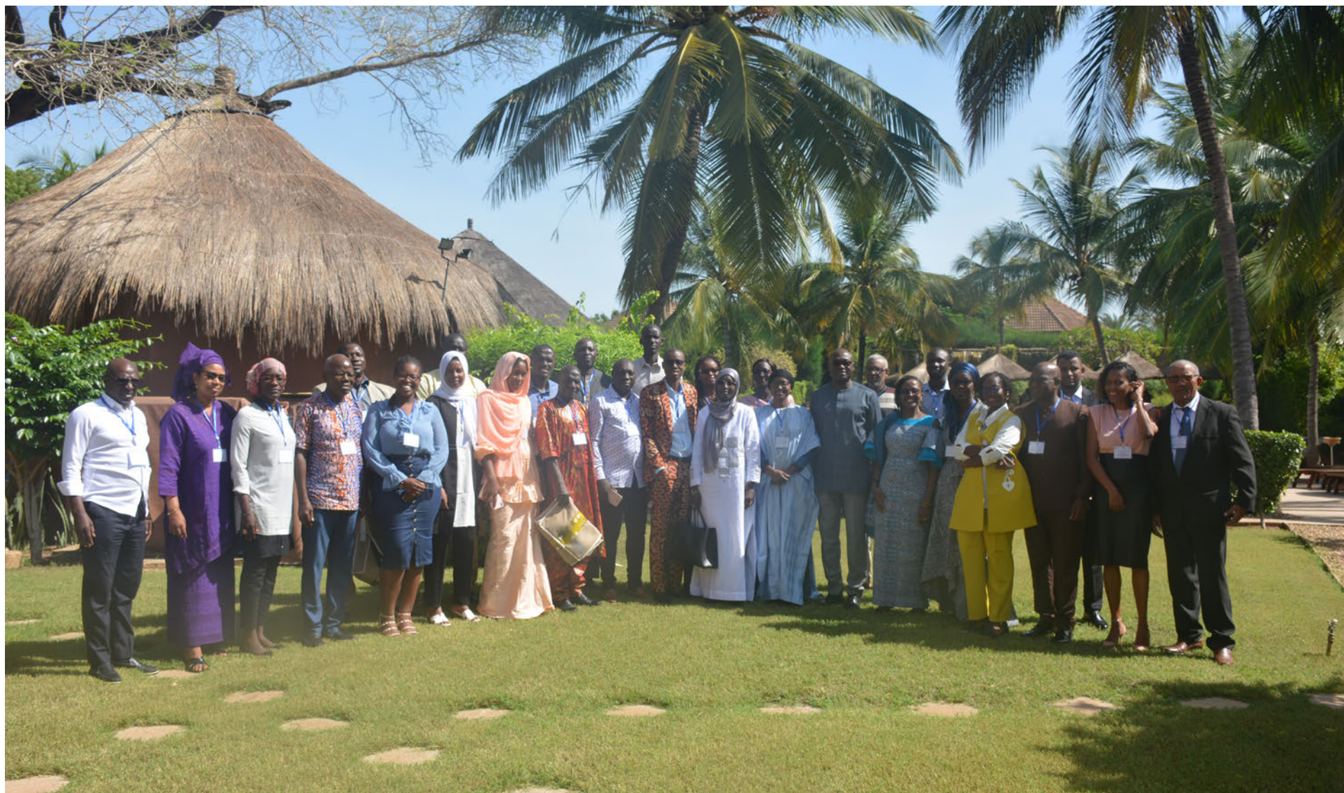
OAS partners (national institutions, CSOs, research institutions, international NGOs, regional organizations) gathered for the final evaluation in Saly, Senegal, October 2022