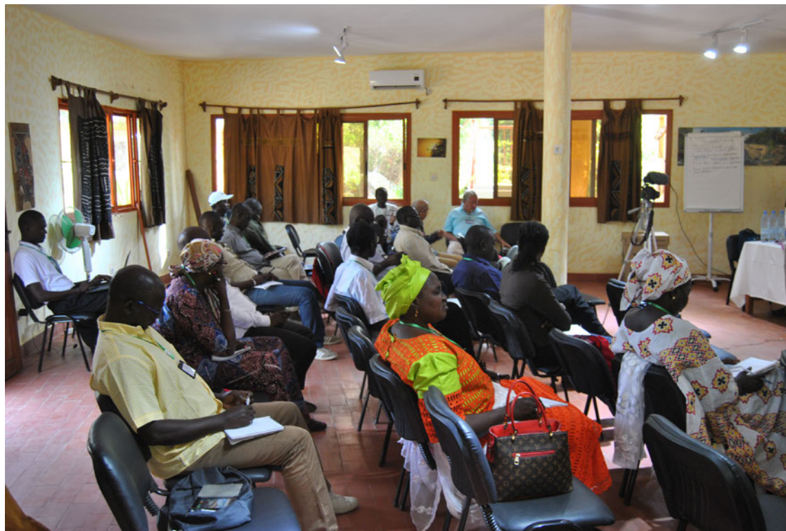
Defining the watch and warning framework in Fimela in the Saloum Delta in Senegal in May 2021

Finally, they will ensure sustainability of progress through the synergies they embody by including all stakeholders.