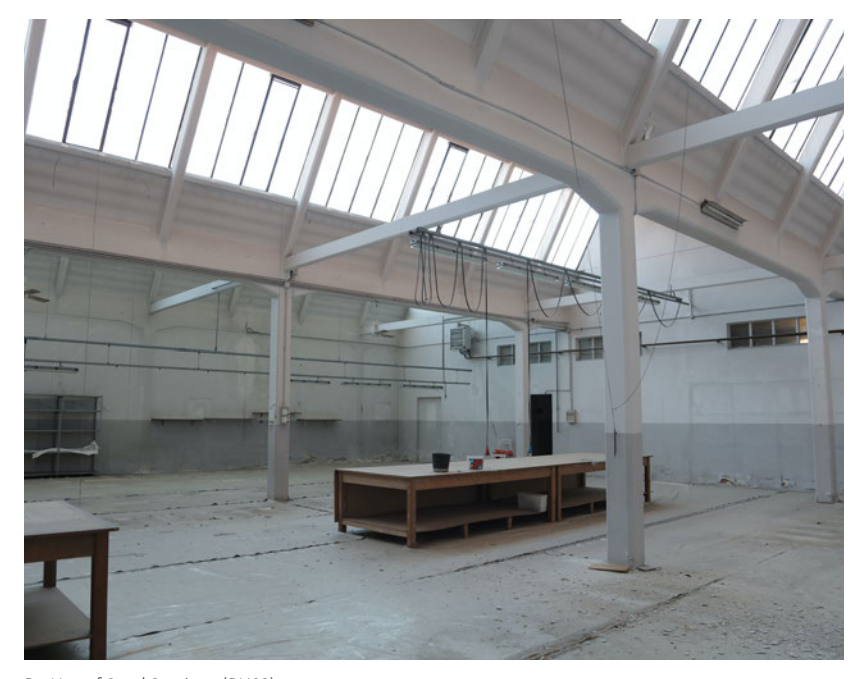
Re-Use of Steel Sections (RUSS)

We need at least two more years to deliver on projects goals, and the search for additional funding has begun.