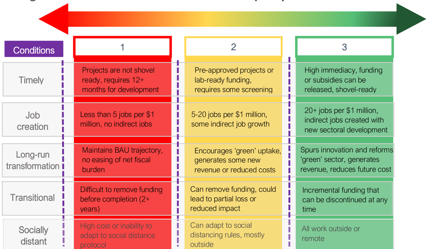
Figure 3: Conditional criteria fulfilment for policy recommendations

Note: All policies are ranked on a scale from 1-3 for each category using this metric. The framework primarily considers direct jobs created. Given the historically high rates of unemployment at this time, consideration